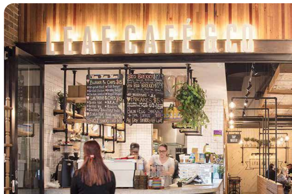
Leaf and Cafe and Co

With so many places within walking distance popping in to the shops for groceries and retail therapy will be a breeze with family and friends. You'll be spoiled for choice with different options that include Seven Hills Plaza, Castle Hill Towers, Blacktown Westpoint Shopping Centre, Winston Hills Shopping Mall and Parramatta Westfields.