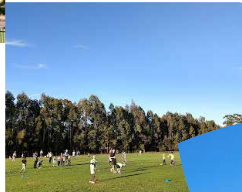
Best Road Reserve

Grove Apartments is well positioned in the close vicinity of great primary and highs schools as well as Universities and Tafs. Such schools include Our Lady of Lourdes Catholic School, The Meadows Public School, Seven Hills Public School, Seven Hills Sports High School, Toongabbie Christian College (High School), Blacktown TAFE, Australia Catholic University Blacktown and Western Sydney University.