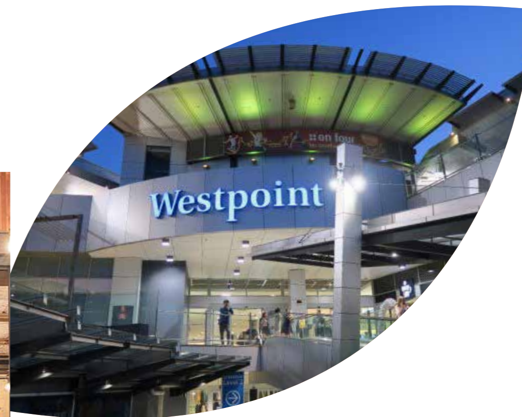
Westpoint Shopping Centre